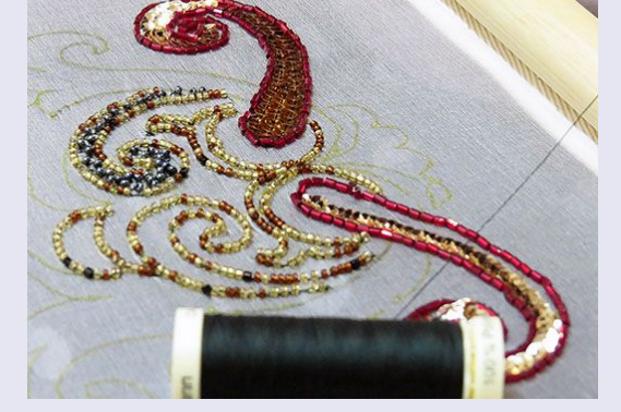
Hand & Lock

Bring your E-ticket along with you for entry.