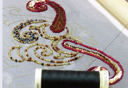
Hand & Lock

Bring your E-ticket along with you for entry.