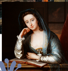
Left: Portraits of Huguenot Women Above: Photographing Spitalfields